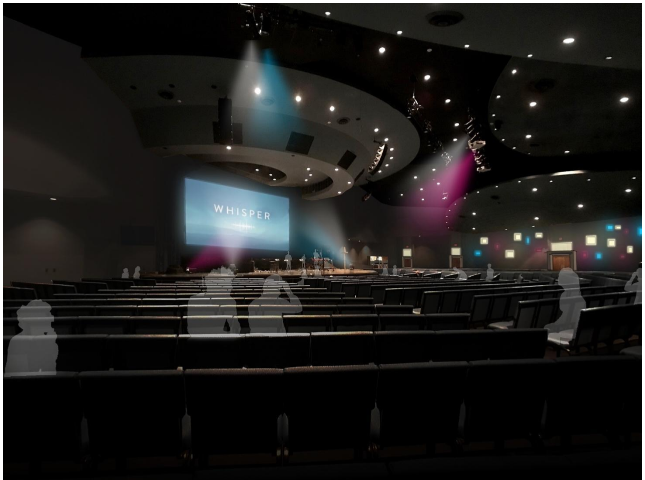
Refreshed main auditorium plus new 250-seat auditorium venue in Valley Community Center for student ministries, worship gatherings, and community events.