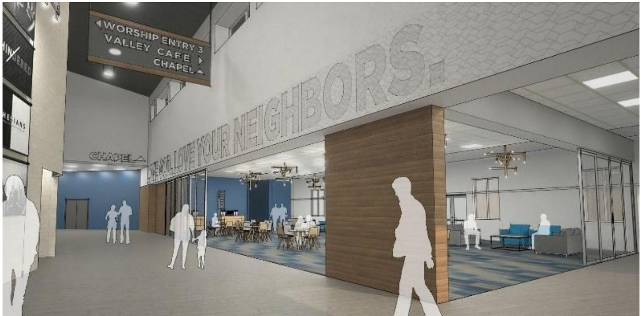
Expanded and renovated atrium with café space for conversation and connection, plus a natural transition to an expanded outdoor courtyard and park-like areas. (To enable the expanded atrium, offices will be relocated to stadium-facing addition)