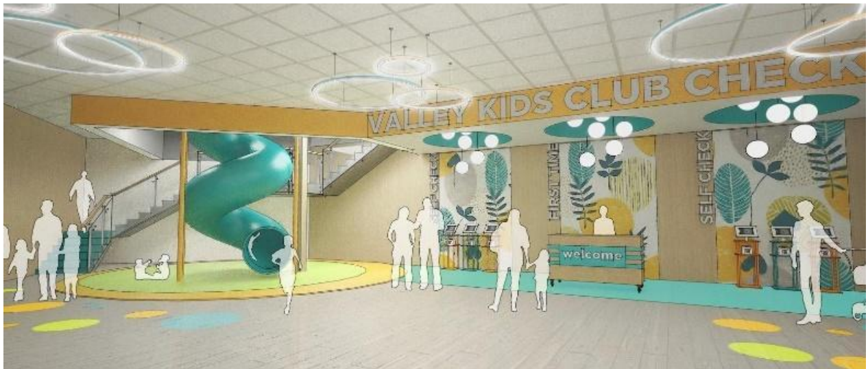
Renovated and expanded children's areas with new indoor play space. All children's ministry will move to the lower level (including nursery) for a more welcoming and secure experience.