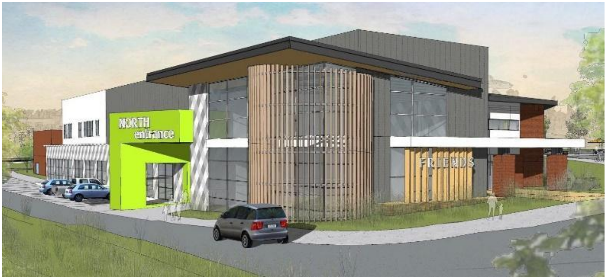
New, safer and more accessible stadium-facing entry to welcome all children and families, including those with disabilities, plus added spaces where families with children can connect.