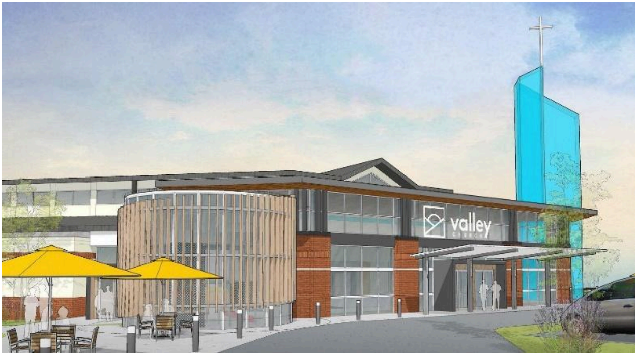
Expanded and welcoming front entrance with added indoor and outdoor spaces to build connection.