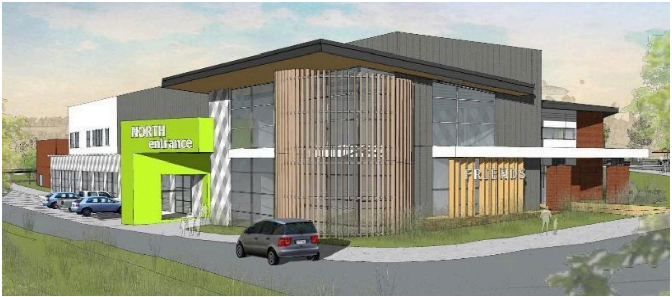
New, safer and more accessible stadium-facing entry to welcome all children and families, including those with disabilities, plus added spaces where families with children can connect.